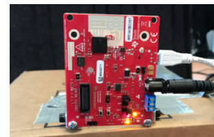
Figure 1: FMCW Wireless Sensor

sensors (?). Although they have shown great success in recognizing ASL, they do have a variety of drawbacks, e.g. the camera interferes with user privacy and the IMU is invasive to the user as it requires them to attach it to their body. Instead, this research team proposes to solve this problem by using a wireless sensor (Fig. 1) which can both protect the user's privacy and eliminate the need to attach devices to the user's body. The sensor will track the movement of the user by reflected signals and develop the general shape of the user's body parts and movement as shown in Fig. 2 left. Transforming the data into a more desired representation allows the machine to learn the patterns of the gestures from the underlying data and translate ASL to English. This paper will focus on the methodology of data representation and how it could be used to perform well in this task.